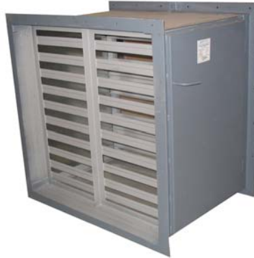
Fig. 1 General view of section of type CF

Section of carbon filter is used for cleaning air of gaseous, vaporous (molecular, organic, and inorganic) pollutants, as well as of odors in extract ventilation systems.