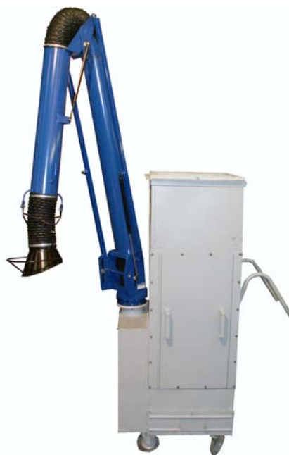
Fig. 1. DEU-M

The dust eliminator unit of recirculation type DEU-M is used for catching finely dispersed aerosols (for example welding and soldering fume) at some not great concentration in the cleaning air. The unit is intended at soldering, point welding and other technological processes. The DEU-M can be used in case of a periodical manual regeneration of a pre-filter (filter for the first step of cleaning)